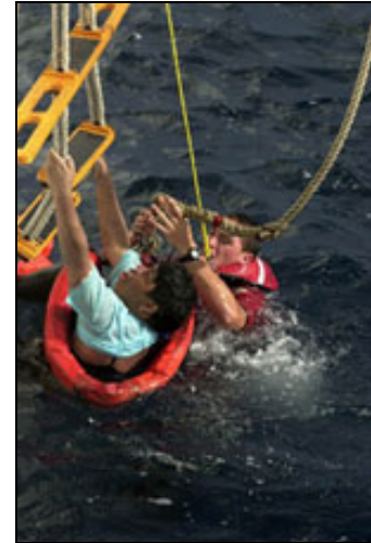
A Coast Guard Rescue at Sea

The United States Coast Guard is a military, multi-mission, maritime service within the Department of Homeland Security and one of the nation's five armed services. Its core roles are to protect the public, the environment, and U.S. economic and security interests in any maritime region in which those interests may be at risk, including international waters and America's coasts, ports, and inland waterways. The Coast Guard provides unique benefits to the nation because of its distinctive blend of military, humanitarian, and civilian law-enforcement capabilities. To serve the public, the Coast Guard has five fundamental roles including: