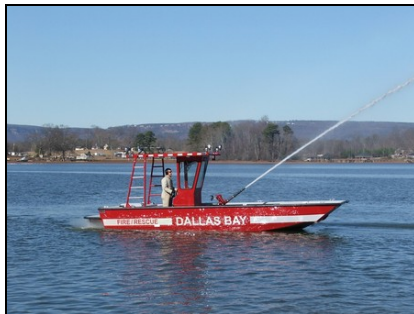
Dallas Bay Fire/Rescue Boat

The Dallas Bay Volunteer Fire Department has acquired a water response unit for their fleet. Tennessee Homeland Security purchased the fire/rescue boat to increase their response capabilities for emergencies on the local river. The boat is also used for hazardous material incidents, boating accidents, fire suppression operations in marinas and homes along the water; and as a mutual aid response to support other agencies, such as, Hamilton County Sheriff's Office, Chattanooga Fire Department and water rescue agencies.