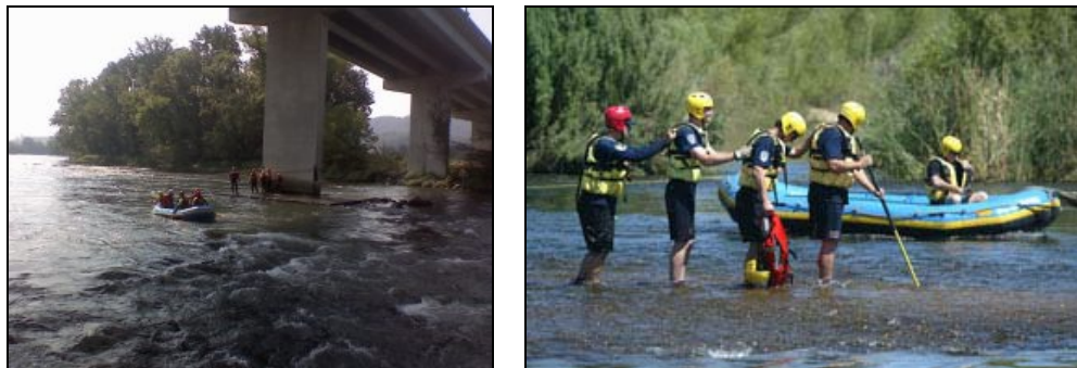
Training in Tennessee

Firefighters from several Tennessee Fire Departments combine their efforts and train for water rescue in the Holston River. They practice maneuvers with a rescue boat, pulleys and ropes strung across a section of the river in the shade of the Interstate 26 Bridge. They have had numerous opportunities to put their training to use in the rescue of fishermen or cars in the water.