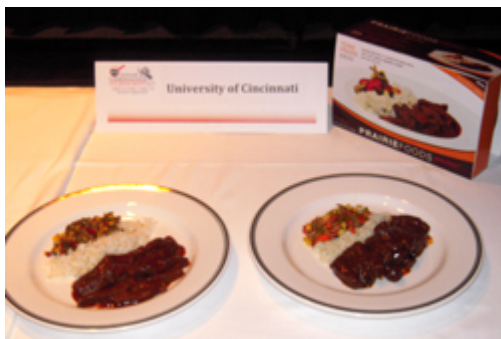
Which is reheated? Look left...

Texas Prairie Duo teams beef in a special sweet & tangy sauce with fire roasted vegetables and ruby red rice. Quoting from the team's competition proposal, "...A medley of fire roasted vegetables complement the beef strips, recreating the experience of camping around a burning fire under the night sky of Texas. The essence of ruby red grapefruit accents the long grain rice, evoking the intertwined history between the citrus fruit and Texan agriculture."