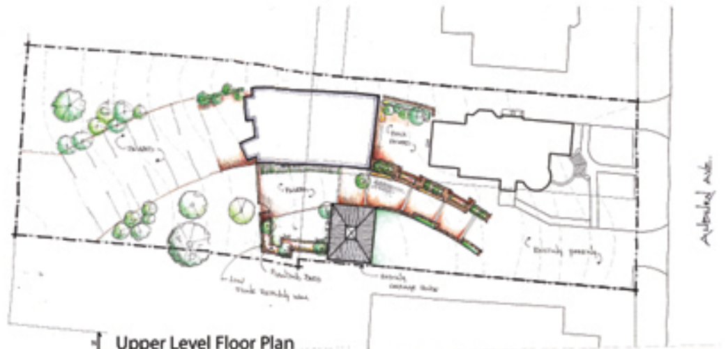
Upper Level Floor Plan

The goal of a building is to provide a space for the family to gather and share their experiences. The building is a series of small-scale, modular units of size and organization that all share a common, primary function, and secondary function. The secondary function is to provide a space for the family to gather and share their experiences. The primary function is to provide a space for the family to gather and share their experiences.