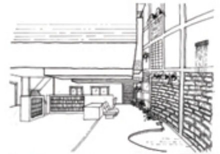
Library & North Wall View

The goal of a building is to provide a space for the family to gather and share their experiences. The building is a series of small-scale, modular units of size and organization that all share a common, primary function, and secondary function. The secondary function is to provide a space for the family to gather and share their experiences. The primary function is to provide a space for the family to gather and share their experiences.