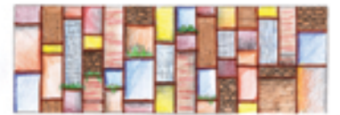
Northern Wall Detail