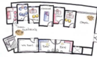
Upper Level Floor Plan

The form of the building is derived from a series of small-scale, modular units of size and organization that all share a common, primary function, and secondary function. The secondary function is to provide a space for the family to gather and share their experiences. The primary function is to provide a space for the family to gather and share their experiences. The building is a series of small-scale, modular units of size and organization that all share a common, primary function, and secondary function. The secondary function is to provide a space for the family to gather and share their experiences. The primary function is to provide a space for the family to gather and share their experiences.