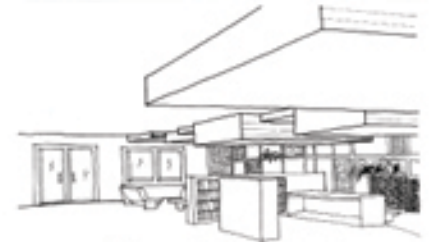
Library & Gathering Room View