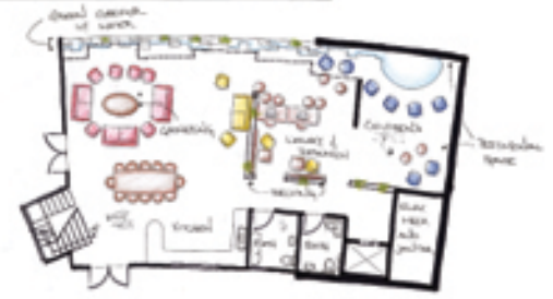
Upper Level Floor Plan