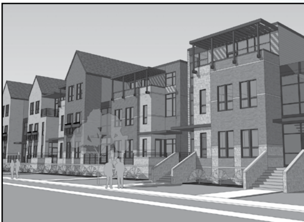
Artist rendering of new Burnet Avenue residential development.

The housing component is moving forward as well. In an area bounded by Harvey and Erckenbrecker Avenues, a residential development will feature more than 30 new units. The housing component — currently known as Harvey Place — is moving forward. The houses will