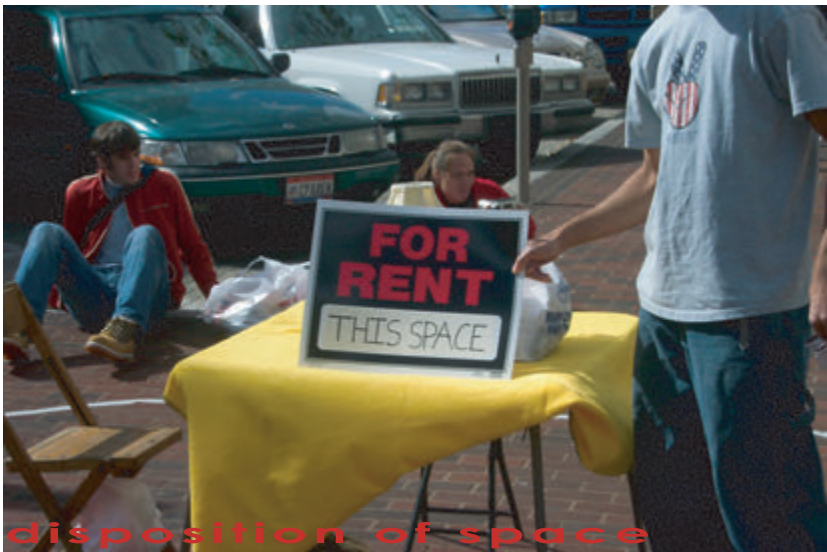
disposition of space

The space or rights to the space have been appropriated, and can now be given or sold to some other entity. It has come under control it is transferable. own it/sell it. Probably the most technical application of disposition. A person has appropriated a space (that can be readily defined) and choosed to dispossess it to another entity.