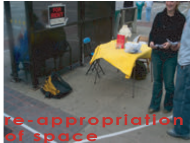
re-appropriation of space